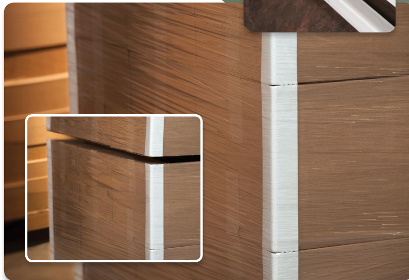
PerfBoard™ provides stackability and protection with the added convenience of perforated legs for easy layer separation