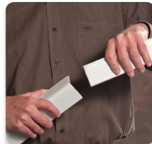
Sections can be quickly portioned by hand