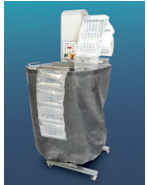
Our AIRplus Excelerator automatically initiates AIRplus production when inventory drops below a certain level using a built-in photoeye that continually checks bag accumulation.