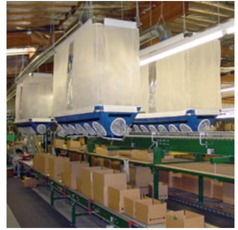
One Excel machine can produce AIRplus pillows that are conveyed through a Storopack overhead dispensing system to multiple packing stations.