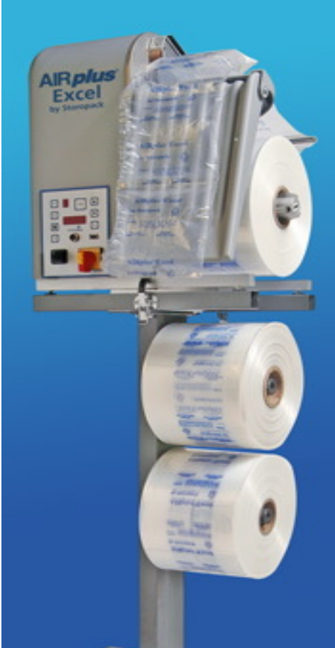
The AIRplus Excel stand holds up to three rolls of film for non-stop production.

AIRplus systems are fast, compact, portable and extremely easy to operate. With their small footprints and large production capacities, AIRplus systems fit easily into any packaging environment — regardless of volumes. The efficient production and clean, lightweight properties of AIRplus make it an ideal material for your packaging needs.